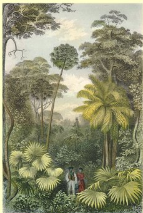
Illawarra Forest 1839